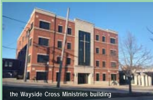
the Wayside Cross Ministries building