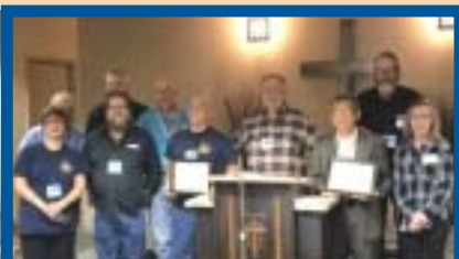
IL Academy Graduates, Sept. 2017

Saturday classes 9/21/24 will be held at Wayside Cross Ministries Chapel, 219 E. New York St., Aurora, IL 60505