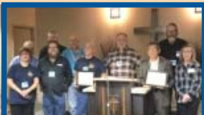
IL Academy Graduates, Sept. 2017

Saturday classes 9/30/23 will be held at Wayside Cross Ministries Chapel, 219 E. New York St., Aurora, IL 60505