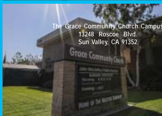
The Grace Community Church Campus 13248 Roscoe Blvd. Sun Valley, CA 91352

Academy classes will include: Biblical Preaching & Teaching, Evangelism, Biblical Counseling, Ethnic Hatred, Sexual Immorality, Forgiveness, Doing Drugs, Fear (Giving Death Notices), Stealing, Feelings of Lonliness, Pride - in Inmate Culture and Spiritual Leadership.