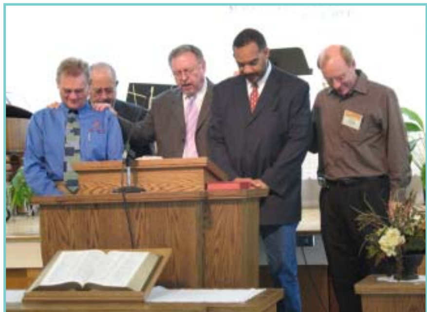
Academy Graduation and Commissioning

Emmanuel Baptist Church 2727 Lake Avenue / P O Box128 Snohomish, WA 98291-0128