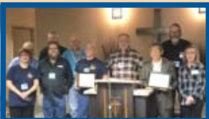
IL Academy Graduates, Sept. 2017

Saturday classes 4/1/23 and in Sept. '23 will be held at Wayside Cross Ministries, 219 E. New York St., Aurora, IL 60505