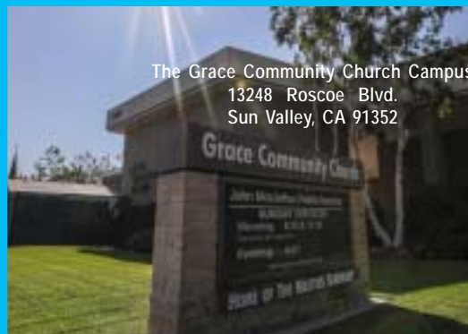
The Grace Community Church Campus 13248 Roscoe Blvd. Sun Valley, CA 91352

Academy classes will include: Biblical Preaching & Teaching, Evangelism, Biblical Counseling, Ethnic Hatred, Sexual Immorality, Forgiveness, Doing Drugs, Fear (Giving Death Notices), Stealing, Feelings of Lonliness, Pride - in Inmate Culture and Spiritual Leadership.