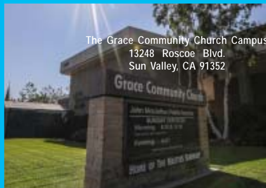
The Grace Community Church Campus 13248 Roscoe Blvd. Sun Valley, CA 91352

Academy classes will include: Biblical Preaching & Teaching, Evangelism , Pastoring Inmates , Loyalty to God, Biblical Counseling, Marriage and Divorce, Working With Corrections Staff, Inmate Issues -Ethnic Hatred, Anger , Counseling Suicidal inmates and Spiritual Leadership .