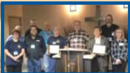
IL Academy Graduates, Sept. 2017

Saturday classes 4/9/22 and Sept. TBA will be held at Wayside Cross Ministries, 219 E. New York St., Aurora, IL 60505