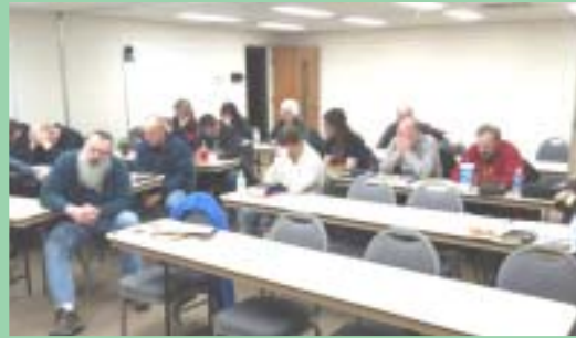
Our IL Classroom at New Covenant Bible Church