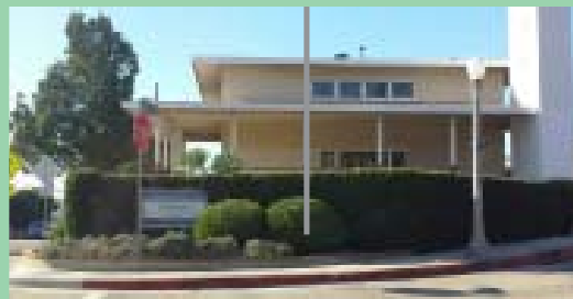
The Los Angeles Reformed Presbyterian Church Campus 3557 Fletcher Drive Los Angeles, CA 90065

Academy classes will include: Biblical Preaching & Teaching, Evangelism, Pastoring Inmates, Biblical Worship, Biblical Counseling, Marriage and Divorce, Volunteers, Working With Corrections Staff, Inmate Issues-Ethnic Hatred, Fear, Giving Death Notices and Spiritual Leadership.