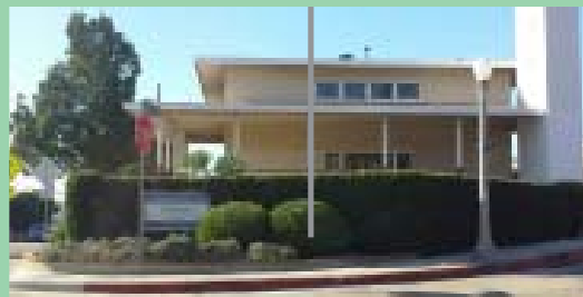
The Los Angeles Reformed Presbyterian Church Campus 3557 Fletcher Drive Los Angeles, CA 90065

Academy classes will include: Biblical Preaching & Teaching, Evangelism , Pastoring Inmates, Biblical Worship, Biblical Counseling, Marriage and Divorce, Volunteers, Working With Corrections Staff, Inmate Issues, Work Ethics, Submission To Authority and Spiritual Leadership.