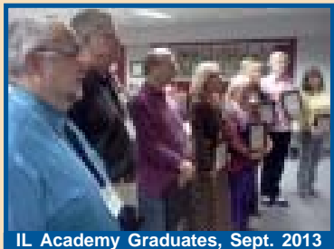
IL Academy Graduates, Sept. 2013

Saturday classes, 9/29/18 & 4/6/19 will be held at Wayside Cross Ministries, 215 E. New York St., Aurora, IL 60505