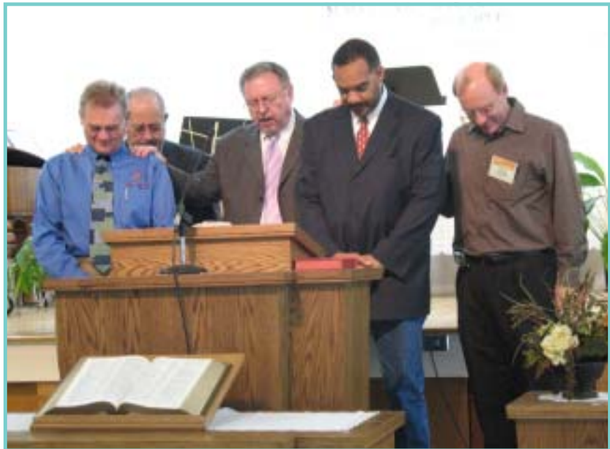
Academy Graduation and Commissioning

Emmanuel Baptist Church 2727 Lake Avenue / P O Box128 Snohomish, WA 98291-0128